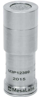
MPIII Pressure Data Logger